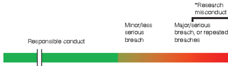
Figure 9.1: Breaches fall on a spectrum. Responsible conduct of research is represented by the green region of the spectrum

The increasing seriousness of a breach of the Macquarie Research Code is indicated by the orange and red regions of the spectrum. Breaches can be minor (less serious) or major (more serious). *If a serious breach also included intentional or reckless or negligent behavior it would be considered research misconduct. Repeated or persistent breaches will likely constitute a serious breach.